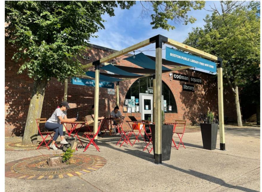
BPL Codman Square pop-up designed by CultureHouse