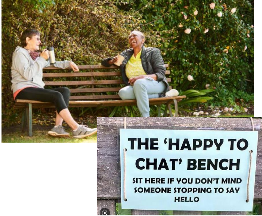
Massachusetts: Salem, Boston,...

"Let's Talk, New York!" Say it like a REAL New Yorker and it RHYMES! SHOW UP – Join one of these upcoming conversations STEP UP – Host a conversation or join our team SIGN UP – keep informed about upcoming events