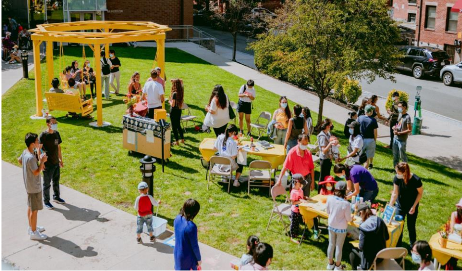
Asian Community Development Corporation, Chinatown, Boston, MA