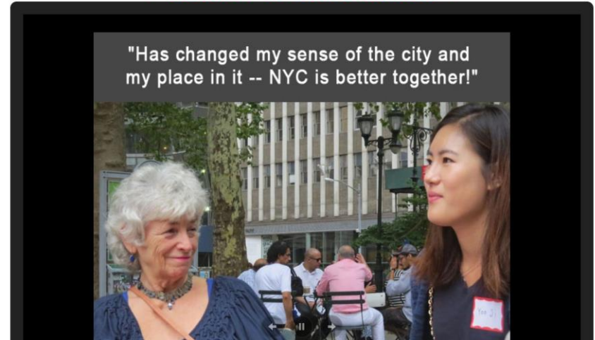
Bryant Park, NYC